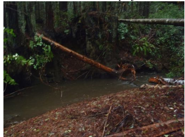
Upstream View from LB – Upper Structure