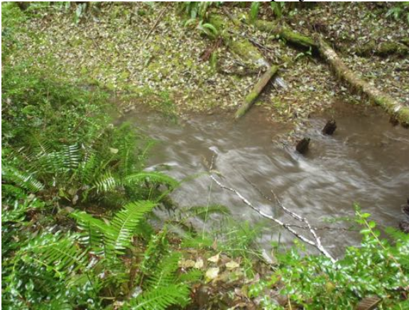
View from RB