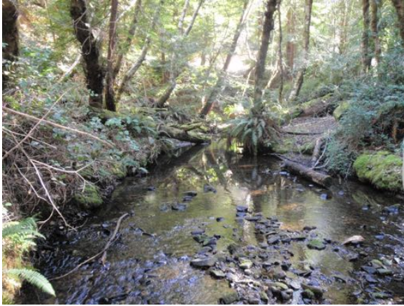
Upstream View from MC