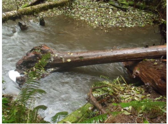
View from RB