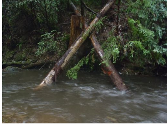
View from LB