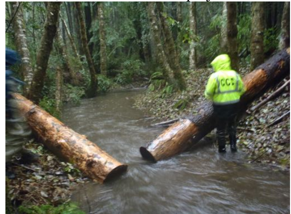
Downstream View from MC