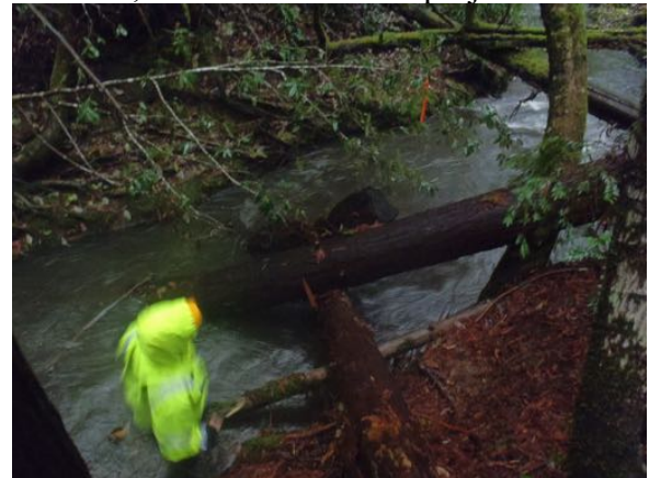
Downstream View from RB