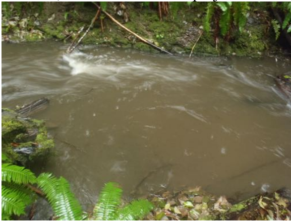
Downstream View from RB – Lower Structure