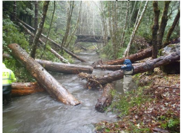
Upstream View from LB