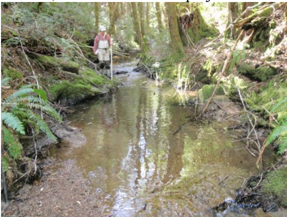
Upstream View from MC