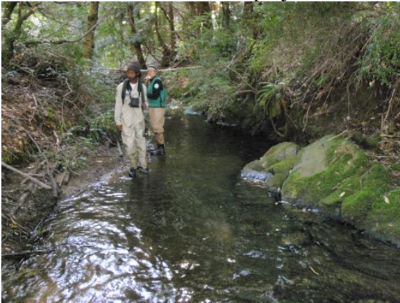
Upstream View from MC – Lower Structure