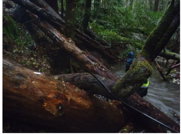
Downstream View from LB