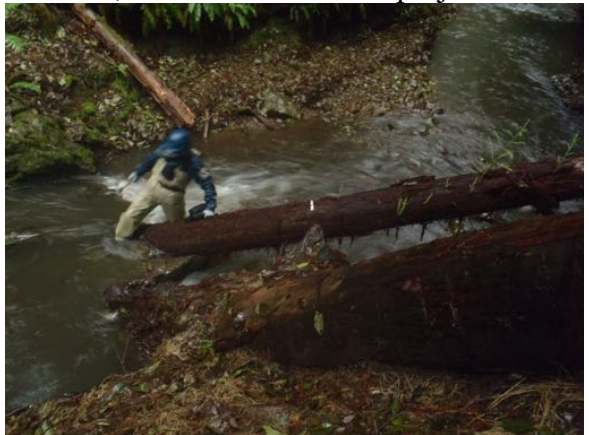
Downstream View from RB