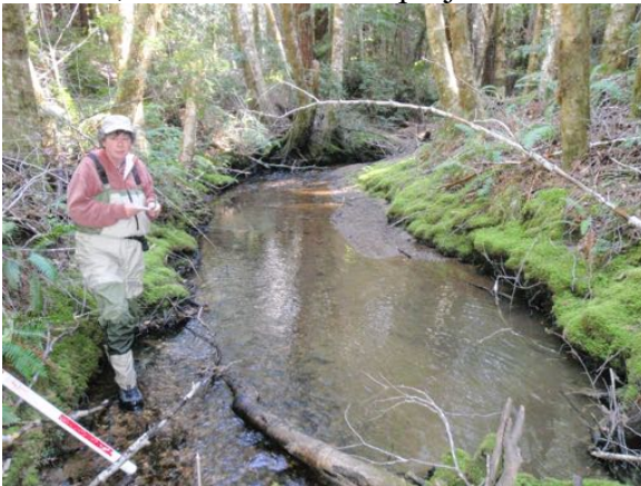
Downstream View from MC