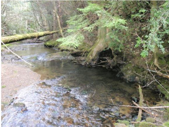
Downstream View from MC