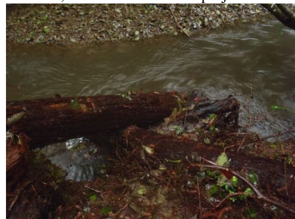
View from RB – Upper Structure