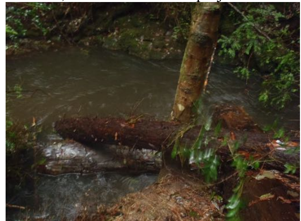
View from RB – Upper Structure