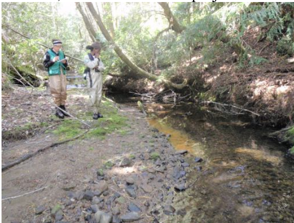
Downstream View from LB