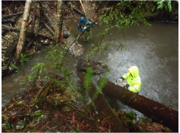
View from RB