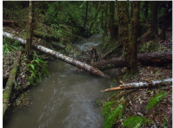
Downstream View from RB