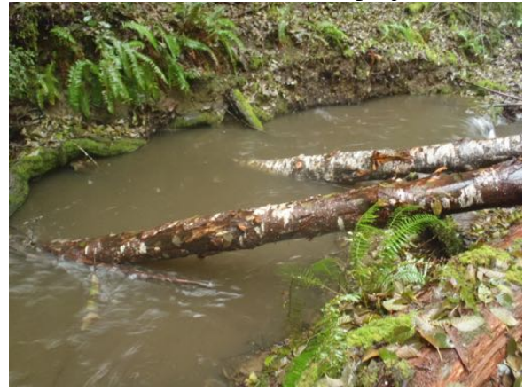
Downstream View from RB – Lower Structure