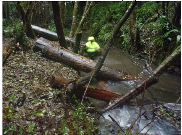
Downstream View from LB