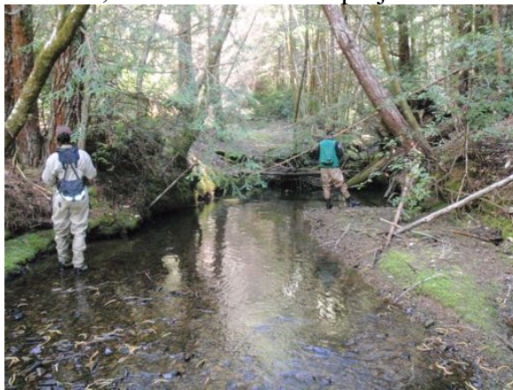
Upstream View from MC – Upper Structure