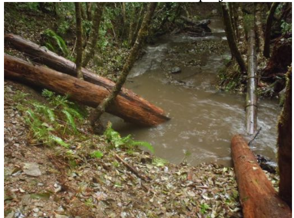
Downstream View from LB