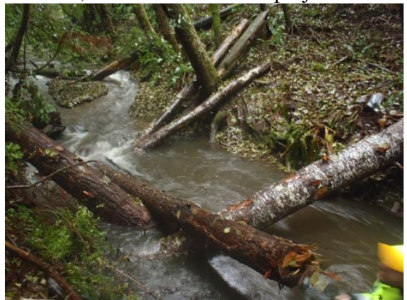
Upstream View from RB