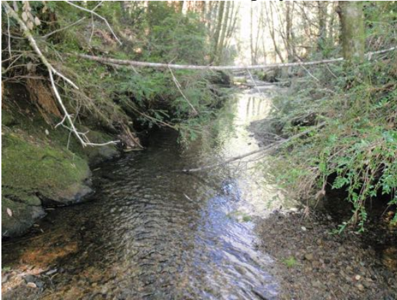
Downstream View from MC – Upper Structure