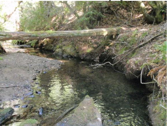
Downstream View from MC