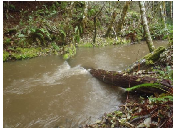
Upstream View from LB