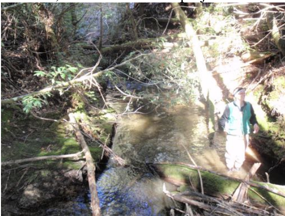
Downstream View from MC