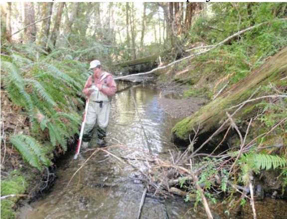
Downstream View from MC