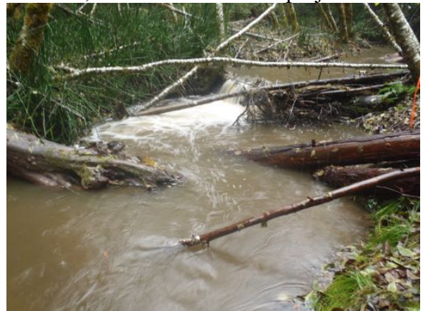
Upstream View from LB – Lower Structure