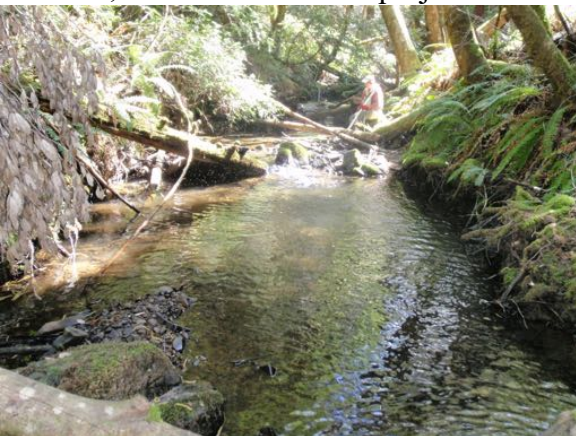
Upstream View from MC