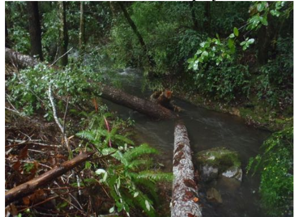
Upstream View from RB