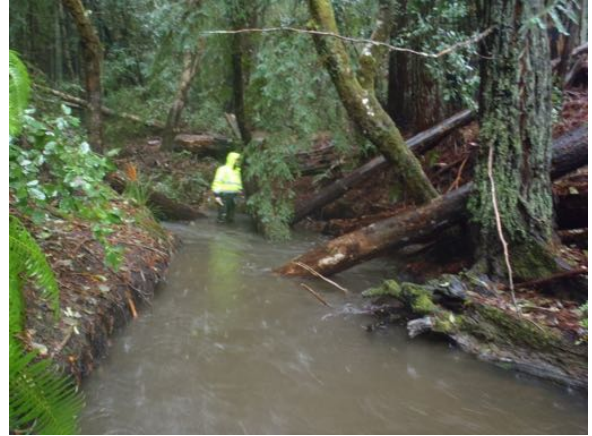
Upstream View from MC – Lower Structure