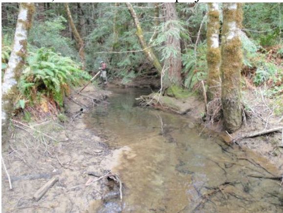
Upstream View from MC