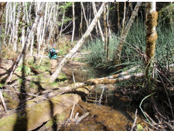
Downstream View from MC – Lower