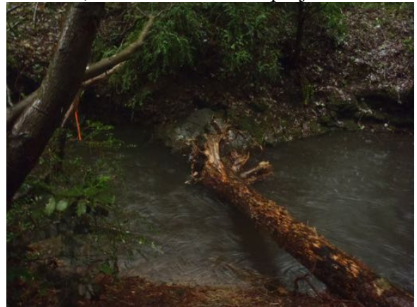
View from RB – Lower Structure