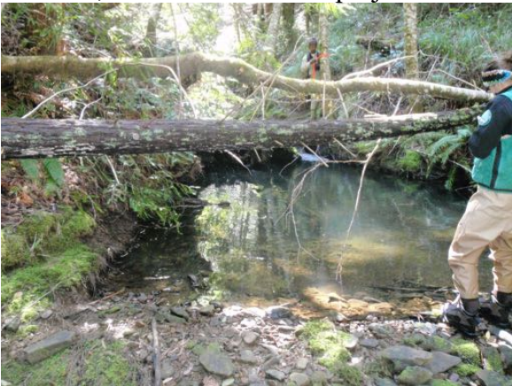
Upstream View from MC