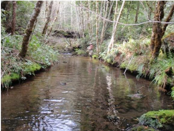
Upstream View from MC