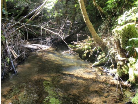
Upstream View from MC