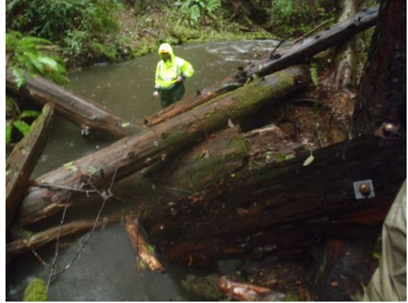
Downstream View from RB