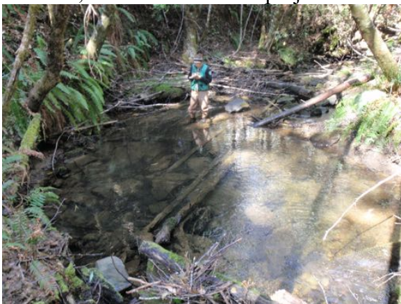
Downstream View from LB