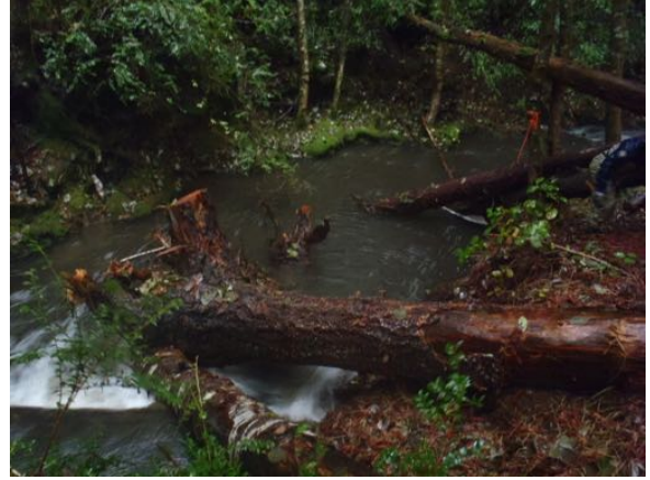
Downstream View from RB