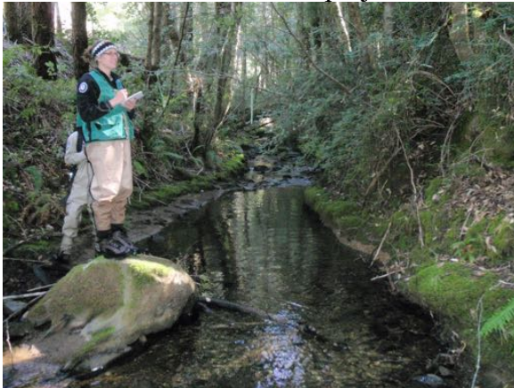
Upstream View from MC