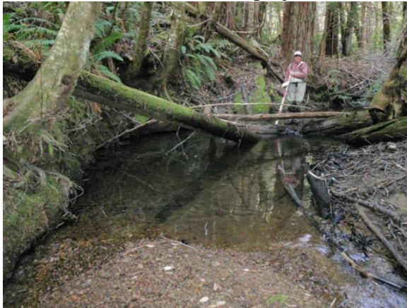
Upstream View from MC – Upper Structure