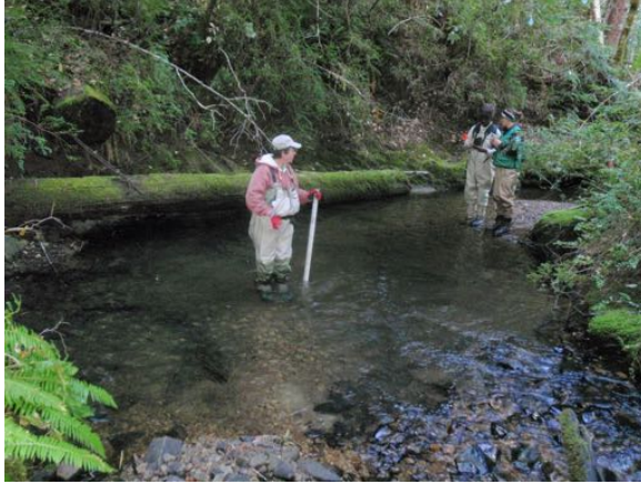
Downstream View from LB