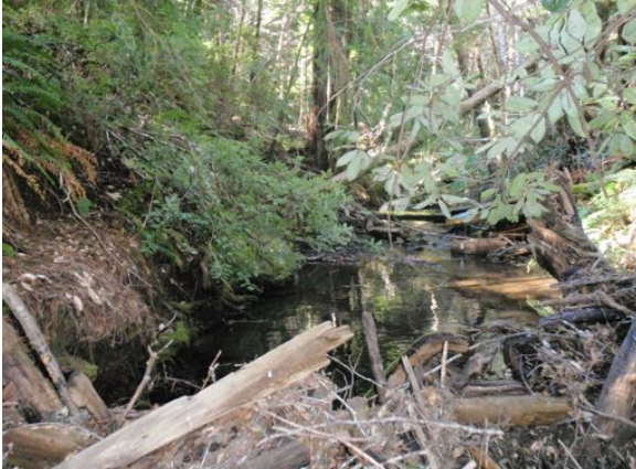
Downstream View from MC