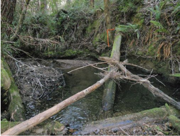
Downstream View from LB – Lower Structure