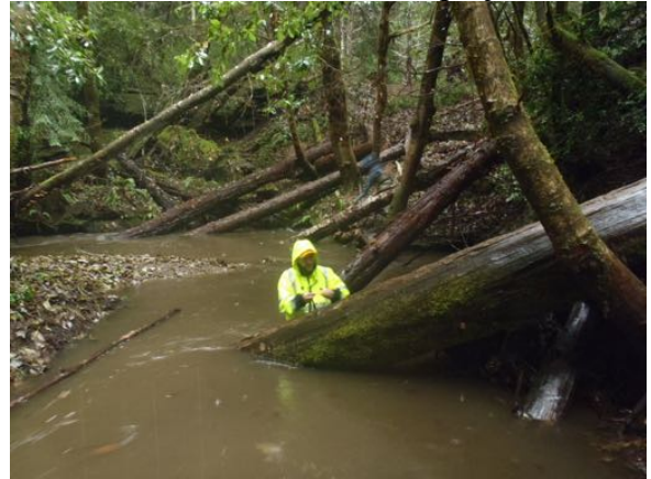
Upstream View from MC