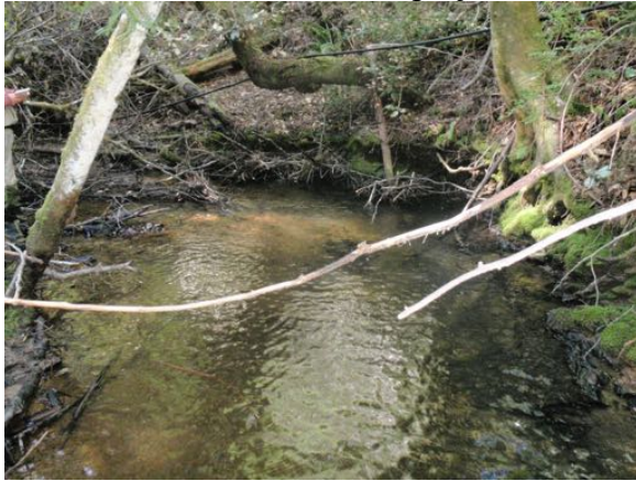
Upstream View from MC