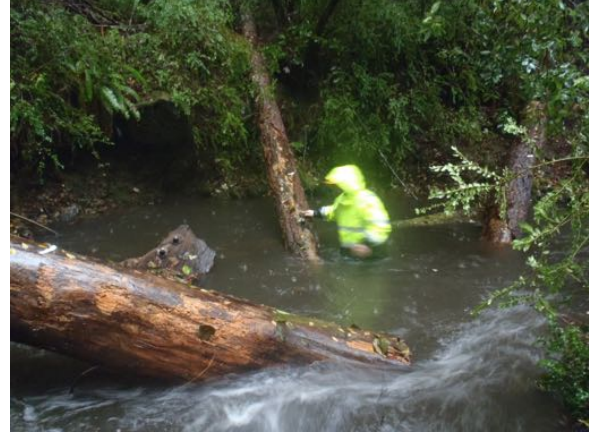
Downstream View from RB