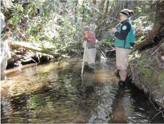
Downstream View from MC