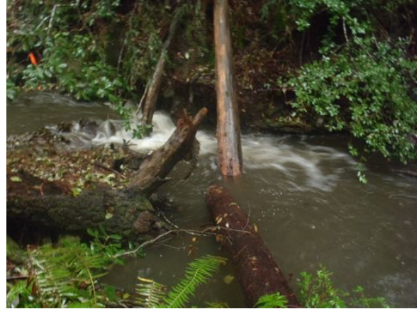
Upstream View from RB