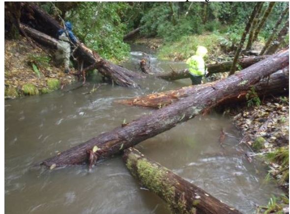
Upstream View from LB